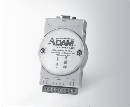
ADAM-4521 UL US LISTED ENEC IEC RoHS COMPLIANT 2002/95/EC