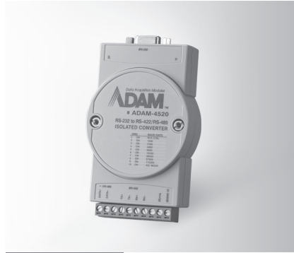
ADAM-4520 FCC CE RoHS COMPLIANT 2002/95/EC