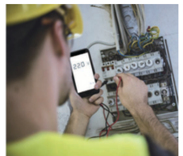
Electric Power Inspection