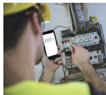
Electric Power Inspection